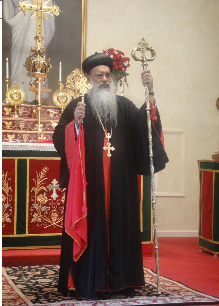
Photo taken at St. Mary's Orthodox Church of Rockland