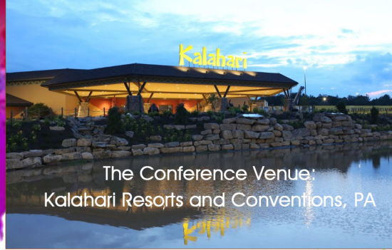
The Conference Venue: Kalahari Resorts and Conventions, PA